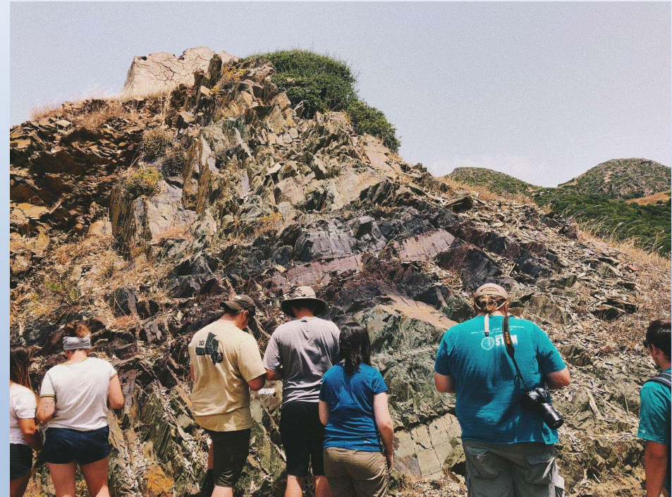
Working on a small introductory outcrop at field camp